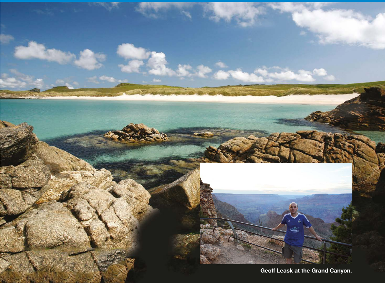
Geoff Leask at the Grand Canyon.

Just post a picture of yourself with the Northern Lights magazine or a NorthLink Ferries' product featuring our iconic Magnus logo in an eye-catching setting to the NorthLink Ferries Facebook page at www.facebook.com/northlinkferries