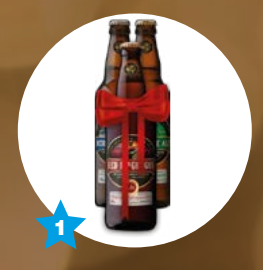
ORKNEY BREWERY Gift pack with three ales £8.95 www.orkneybrewery.co.uk