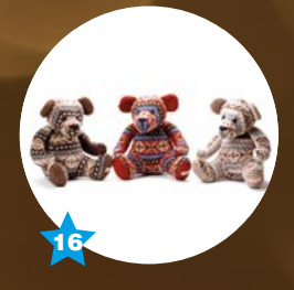
BURRA BEAR Collectable Shetland toy bear From £65 www.burrabears.co.uk