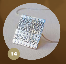
PENDANT Pendent with traditional Fair Isle patterns £140 www.redhouss.co.uk