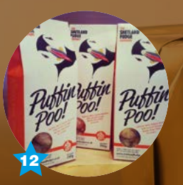
PUFFIN POO BY THE SHETLAND FUDGE COMPANY Chocolate treats (100g) £2.50 www.shetlandfudge.co.uk