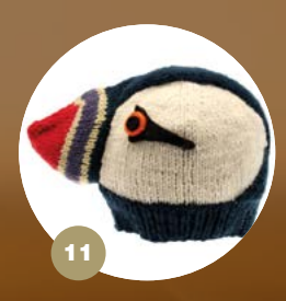
PUFFIN HAT Hand-knitted, 100% wool hat with fleece lining £10.95 www.peerieshop.co.uk