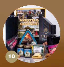
GIFT SET A variety of local Island produce £38.95 www.orkneywine.co.uk