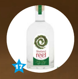
SHETLAND REEL HOLLY DAYS GIN Limited edition gin £35