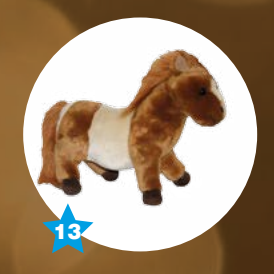
DOWMAN CUDDLE SHETLAND PONY Soft toy £9.99 www.dowman.com