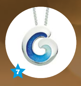
SHEILA FLEET 'WAVE' PENDANT Handcrafted jewellery capturing Orkney's beauty £79 www.sheilafleet.com