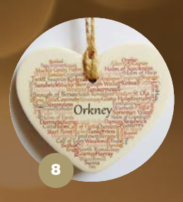
ART Ceramic Heart featuring iconic Orkney places £7.99