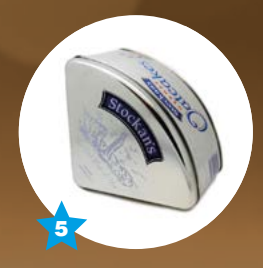
STOCKANS LUXURY OATCAKE GIFT TIN Oatcakes and storage tin £10 www.stockans.com