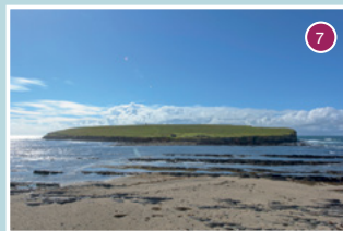
The Brough of Birsay – Walk to this island when the tide is low.