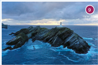
Muckle Flugga – Britain's most northerly lighthouse.