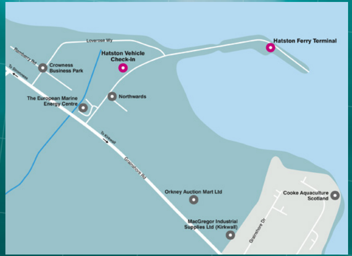
Hatston Ferry Terminal, Hatston Quay, Kirkwall, Orkney, KW15 1RQ https://www.northlinkferries.co.uk/port/hatston/