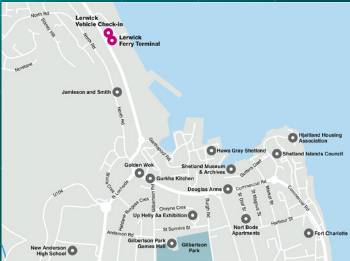
Lerwick Ferry Terminal, Holmsgarth Road, Lerwick, Shetland, ZE1 0PR https://www.northlinkferries.co.uk/port/lerwick/