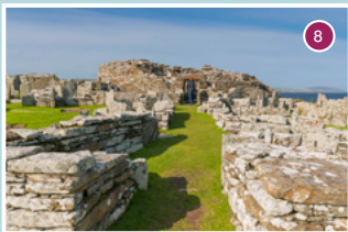
The Broch of Gurness – Iron Age circular stone tower and settlement.