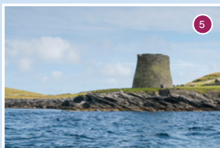
Mousa Broch – One of the best preserved Iron Age brochs.