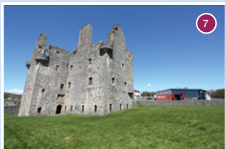
Scalloway Castle – A castle with a brutal history built in 1599.