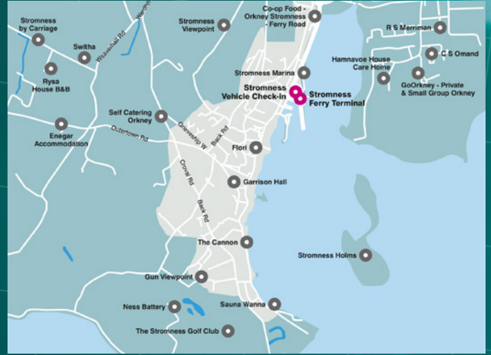
Stromness Ferry Terminal, Ferry Road, Stromness, Orkney, KW16 3BH https://www.northlinkferries.co.uk/port/stromness/