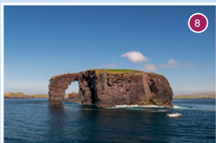
Eshaness and Dore Holm – Dramatic cliffs and volcanic scenery.