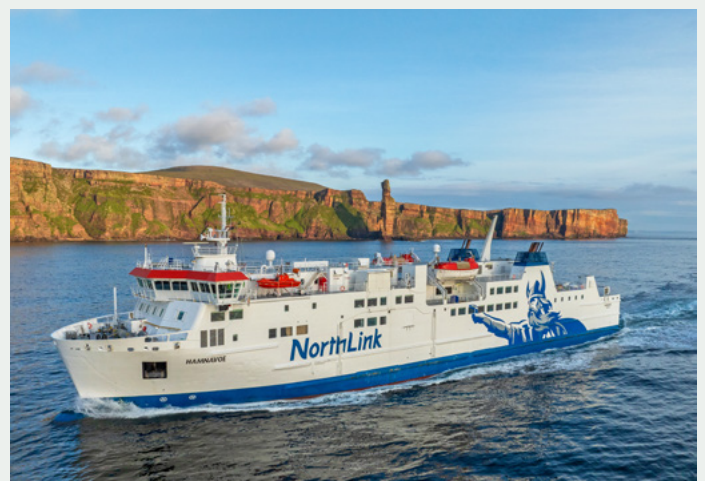
MV Hamnavoe sailing to the Orkney Islands

NorthLink Ferries operate a 90-minute crossing up to three times a day between Scrabster and Stromness in Orkney. MV Hamnavoe is the only ferry crossing to Orkney which passes the breathtaking sea stack, the Old Man of Hoy.