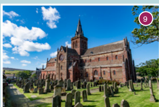
St Magnus Cathedral – A Viking cathedral built in 1137.