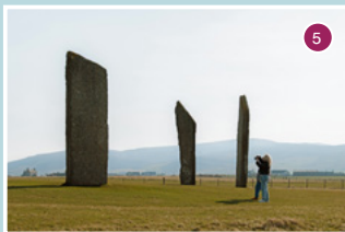
Standing Stones of Stenness – Four imposing standing stones.