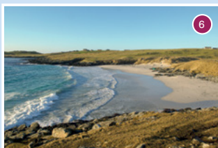
Meal beach – A lovely sandy beach.