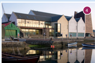
Shetland Museum and Archives – A fascinating place on Lerwick's waterfront.