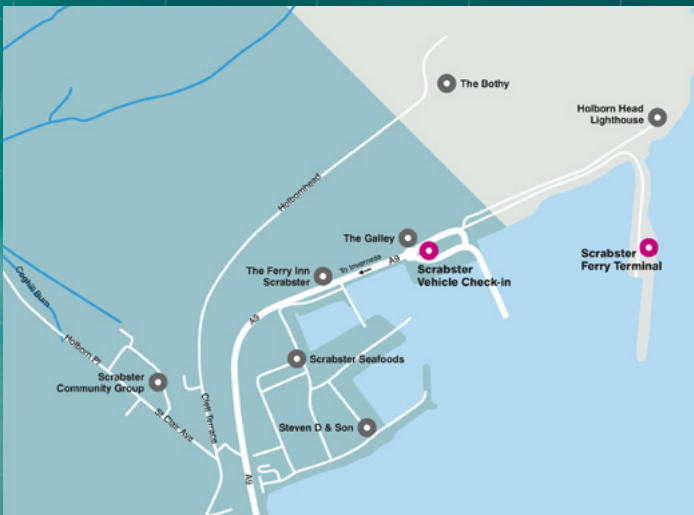
Scrabster Ferry Terminal, Queen Elizabeth Pier, Scrabster, Caithness, KW14 7UW https://www.northlinkferries.co.uk/port/scrabster/