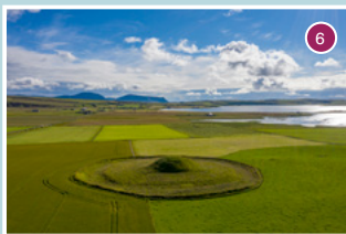
Maeshowe – Large Neolithic tomb with Viking runes.