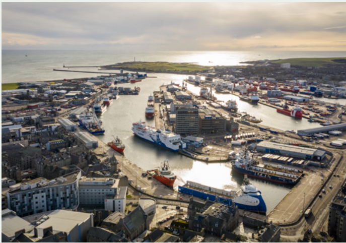
MV Hjaltland docked in Aberdeen

The Northern Isles are breathtaking and wild, rich in Norse and Scottish history, wildlife, delicious food and drink, unique folklore, music, poetry and prose. Orkney and Shetland are both quite unlike anywhere else in the UK. With NorthLink Ferries they're closer than you think.