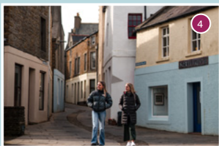
Stromness – Picturesque port for MV Hamnavoe.